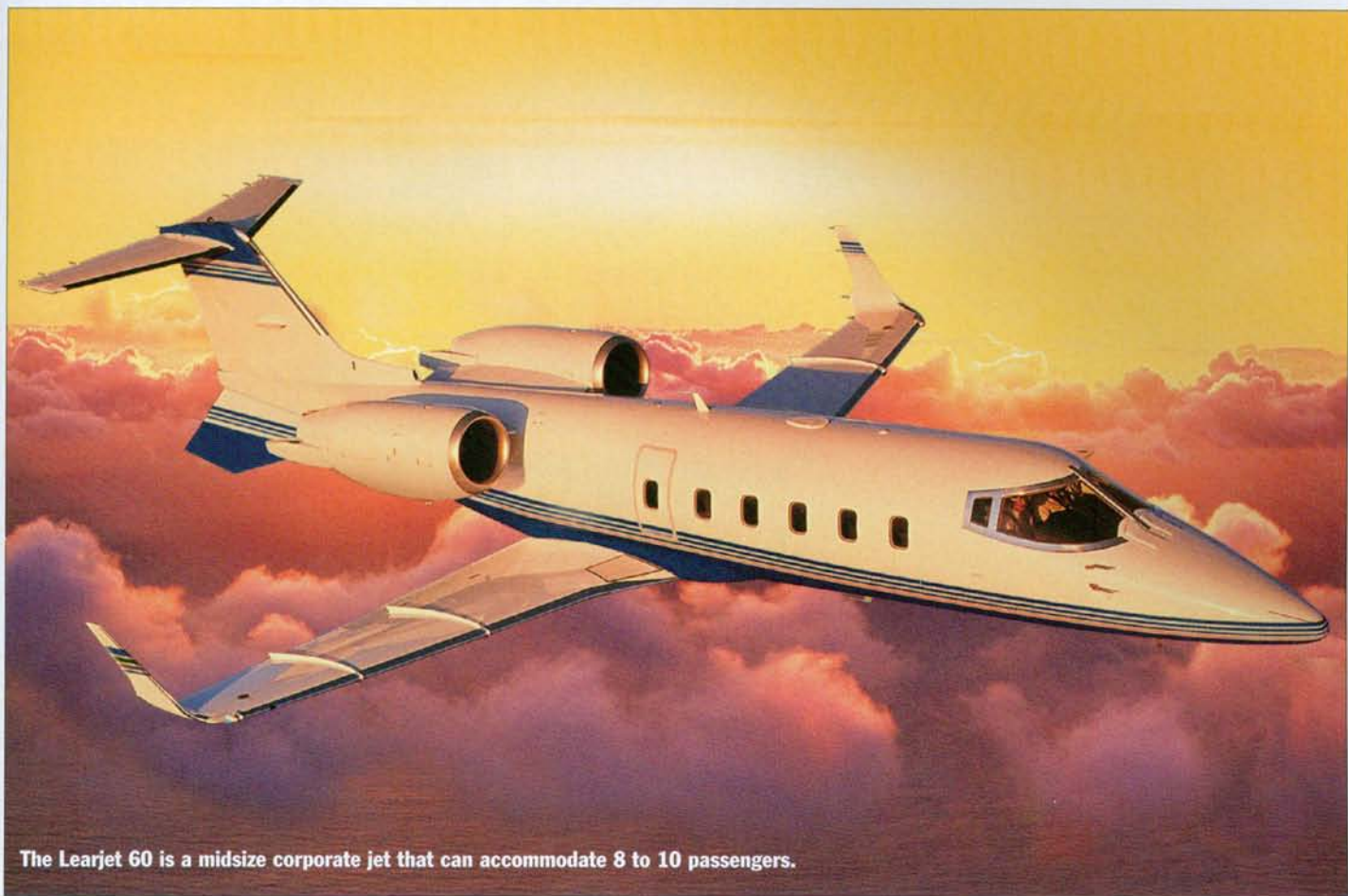
The Learjet 60 is a midsize corporate jet that can accommodate 8 to 10 passengers.

in-flight secretary and a custom-designed office space featuring a deluxe media center.