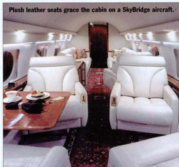
Plush leather seats grace the cabin on a SkyBridge aircraft.

and surround-sound audio. If your mindset is business first, SkyBridge Private Air can arrange for an