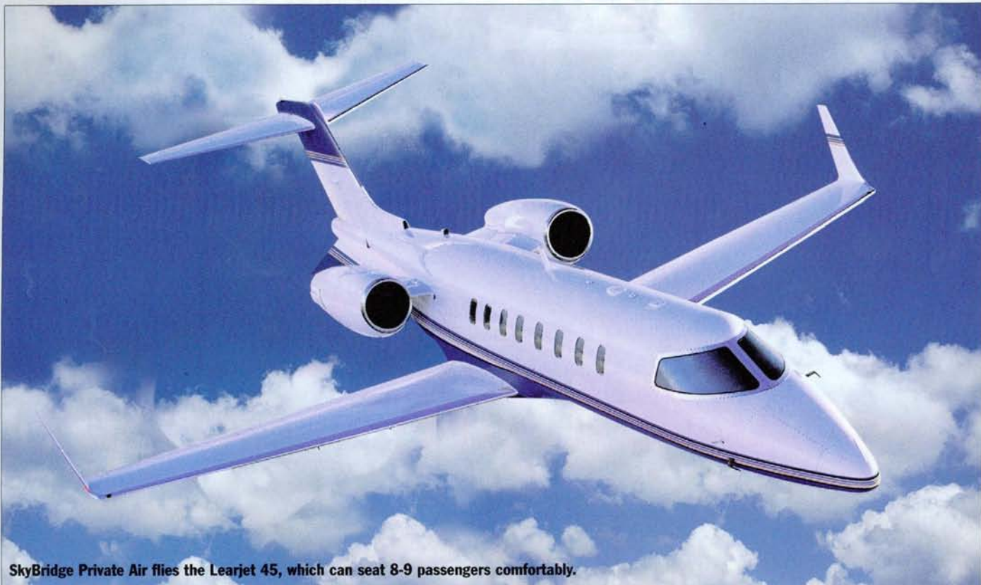
SkyBridge Private Air flies the Learjet 45, which can seat 8-9 passengers comfortably.

Spa Services, Chilled Cristal, and Gourmet Food Are on the Menu